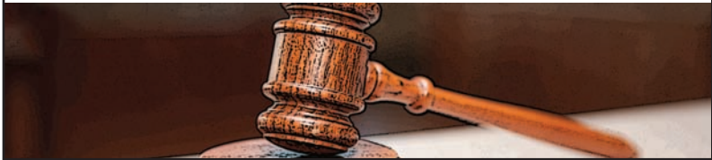
© 2022 Legal Journal of Susquehanna County