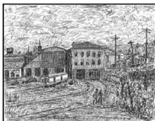
The Round House, circa 1960