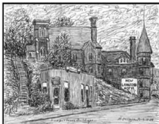
Nell's, circa 1960